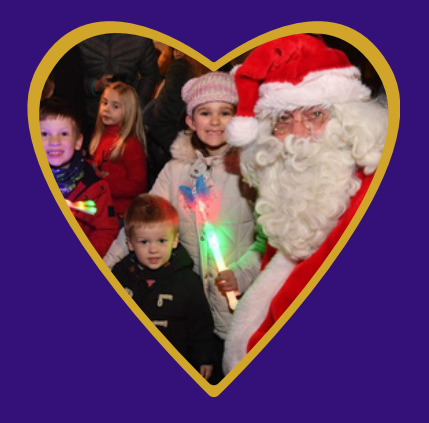
Join us on 16th November for the Christmas Market at Llandaff Rowing Club from 11am to 4pm