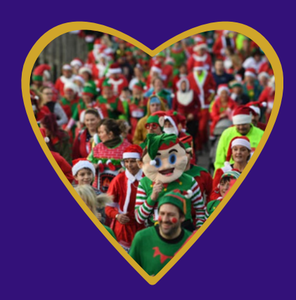
Attend one of our Christmas Events listed on the following page.

All funds raised are used and spent in Wales towards part-funded Heart Screening Sessions, public access Defibrillators and free CPR training.