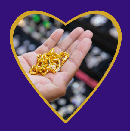
Purchase a £2 Gold Heart from us to wear this Christmas.