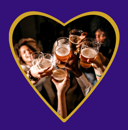
Organise a Christmas quiz night in your local pub or club.